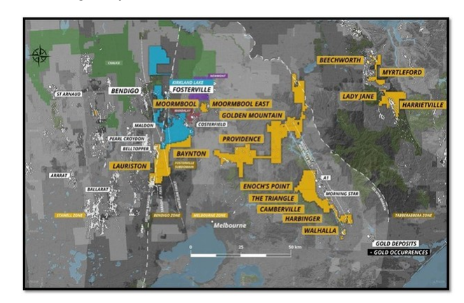
Figure 2 - Fosterville South Overview Map

Chief Operating Officer, Rex Motton, states, "With multiple drill permits in hand and significant fieldwork completed to vector in on key drilling targets, drilling is now ramping up on multiple high priority projects. Fosterville South is well financed and in a strong position to accelerate drilling and we look forward to increasing assay data flow from this work on site."