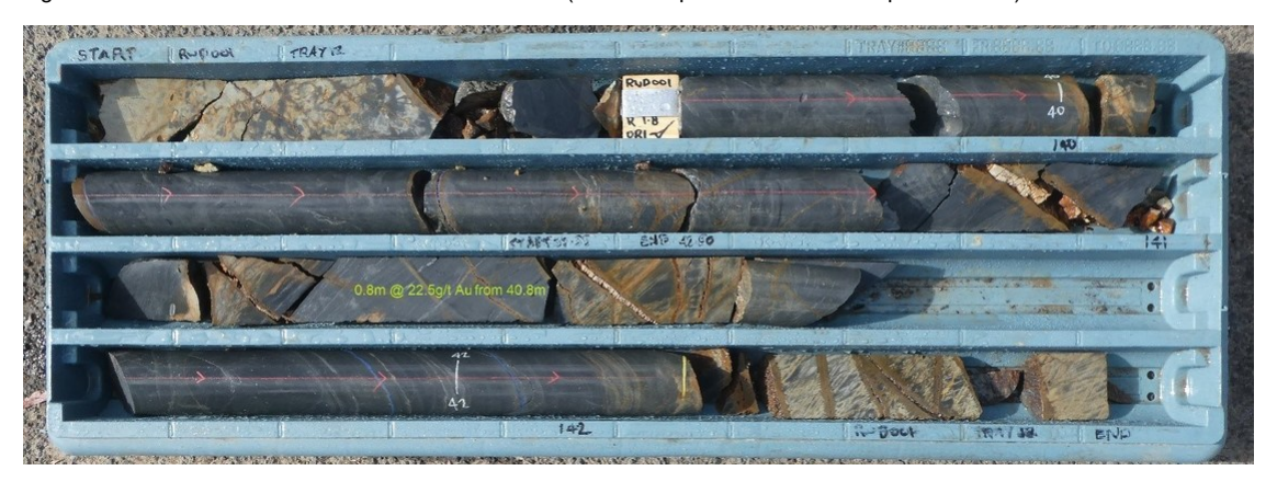
Figure 3 - Drill Core from RWD01 from 39.35m to 42.50m