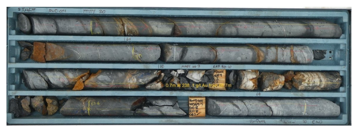
Figure 2 - Drill Core from RWD01 from 66.7m to 70.1m