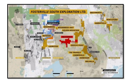
Figure 2 - Fosterville South Overview Map (CNW Group/Fosterville South Exploration Ltd.)

Figure 1 – Providence Project Overview Map (CNW Group/Fosterville South Exploration Ltd.)