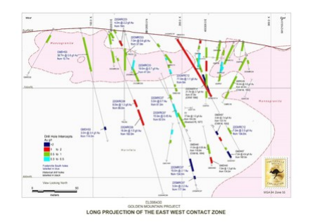
Figure 2 – Longitudinal Section of the drilling at Golden Mountain prospect, Tallangallook