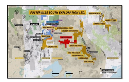
Figure 3 – Fosterville South Overview Map (CNW Group/Fosterville South Exploration Ltd.)

Figure 2 - Providence Project Overview Map (CNW Group/Fosterville South Exploration Ltd.)