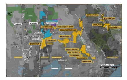
Figure 3 – Fosterville South Overview Map

Fosterville South also plans to carry out reverse circulation drilling at the Heyfield prospect at Golden Mountain. Heyfield has signatures of Au-As-Sb and is an excellent target for epizonal style mineralization in the Melbourne Zone.